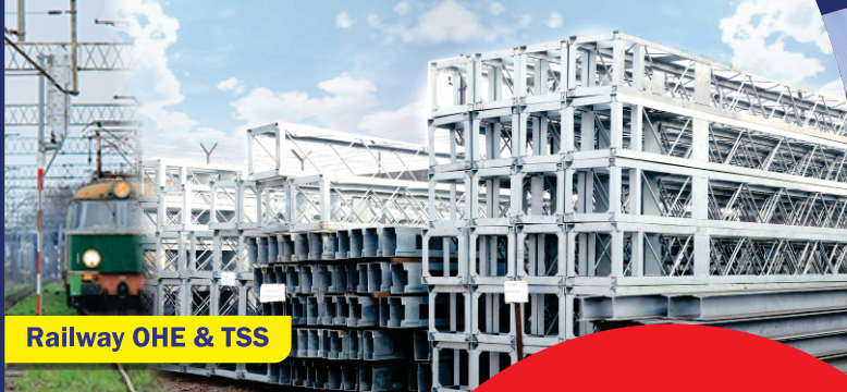
Railway OHE & TSS