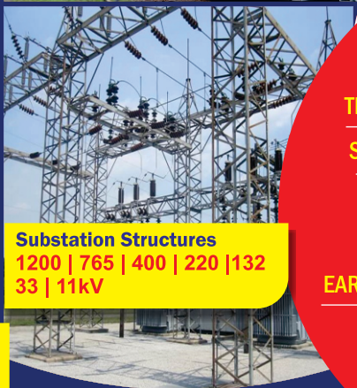
Substation Structures 1200 | 765 | 400 | 220 | 132 33 | 11kV

OHE STRUCTURES FOR RAILWAY ELECTRIFICATION & METRO TRANSMISSION LINE TOWERS UPTO 765 kV SUB-STATION STRUCTURES UPTO 1200 kV RURAL ELECTRIFICATION STRUCTURES CABLE TRAYS & ACCESSORIES EARTHING MATERIALS, FOUNDATION BOLTS ETC ALL OTHER STEEL STRUCTURE AS PER DRAWING DESIGN AND SPECIFICATION FROM CUSTOMERS